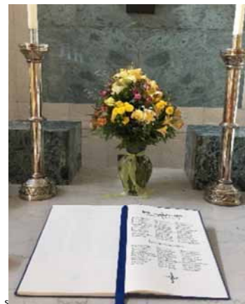
During the month of November please come and remember your loved ones with us as we display their names in the church and on the Altar.