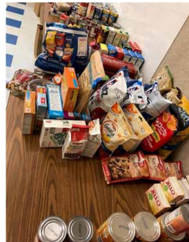
Faith Formation's Thanksgiving Food Drive