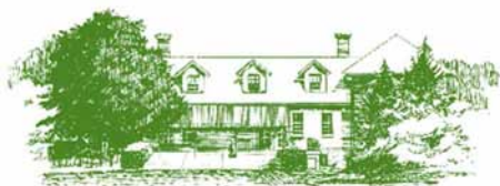
St. Agnes Church Greenwich, Connecticut

We have a 4 bedroom apartment for rent at St Agnes. If you have friends or family please share this news. All interested should email: