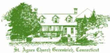
St. Agnes Church Greenwich, Connecticut

We have a 4 bedroom apartment for rent at St Agnes. If you have friends or family please share this news. All interested should email: