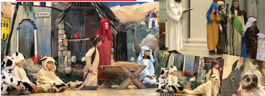
Christmas Pageant at St. Catherine's A joyous celebration of the season!

Each participant purchases their own book.