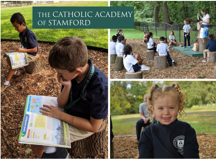
THE CATHOLIC ACADEMY OF STAMFORD