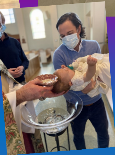
Blessings abound at St. Catherine's!