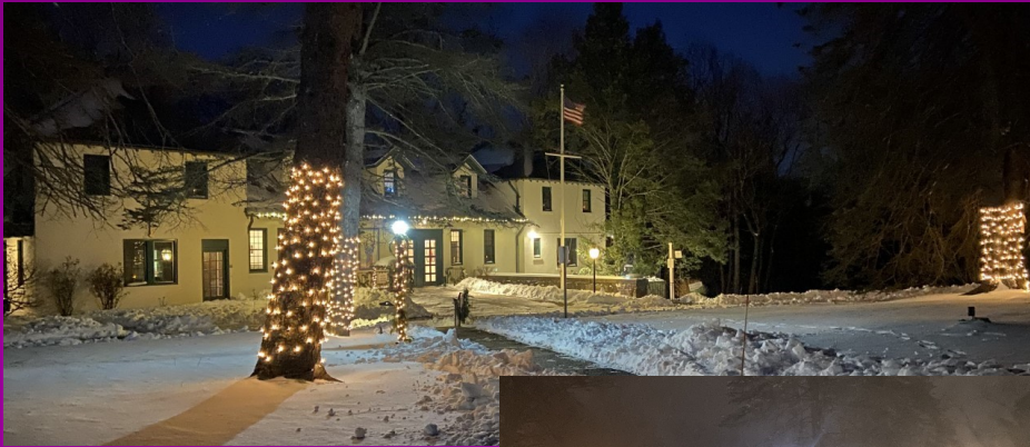
St. Agnes campus embracing the snow and the season!