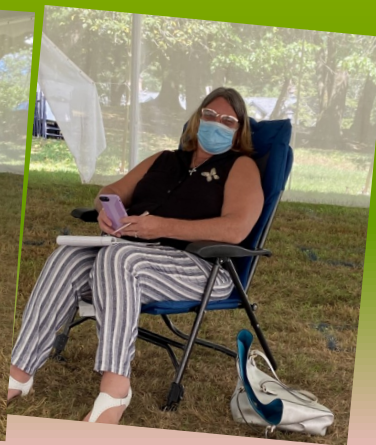
Parish Partners meet safely under the tent