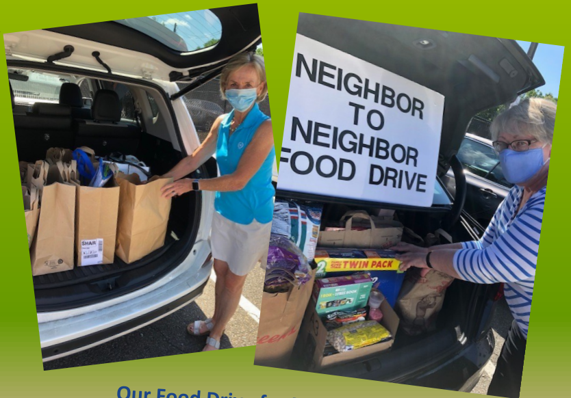
Our Food Drive for Neighbor To Neighbor continues on strong!