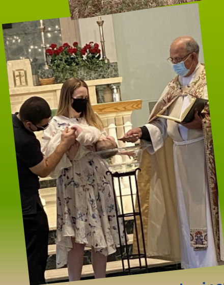
Beautiful Baptism in St. Catherine's Church