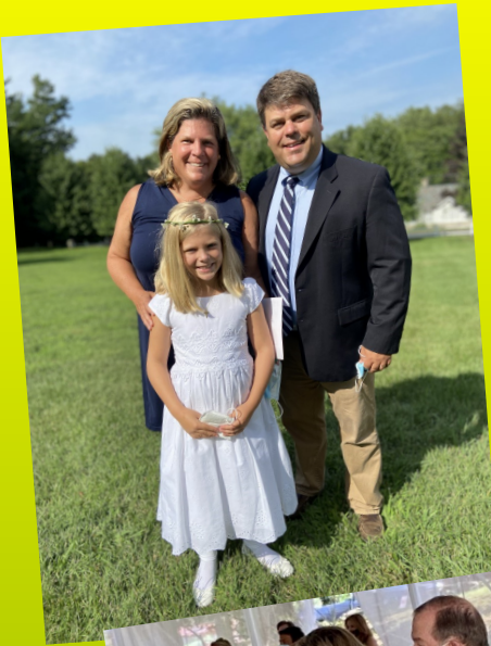
First Holy Communion under the tent at St. Agnes