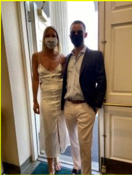
The Bride & Groom arrive at St. Catherine's!