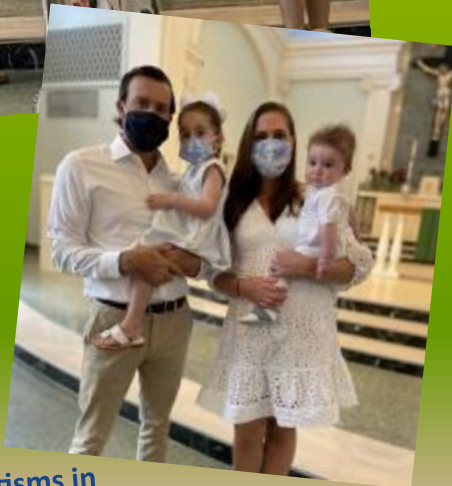
Beautiful Baptisms in St. Catherine's Church