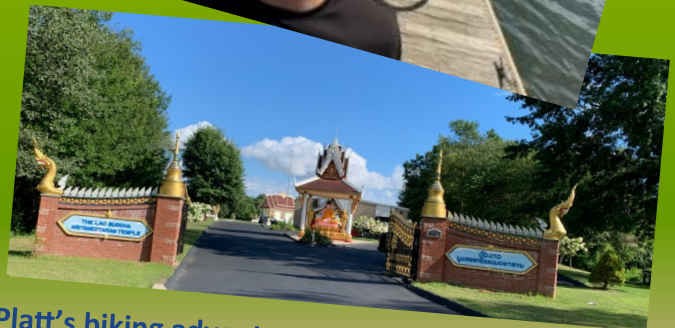
Fr. Platt's biking adventures continue on Litchfield's Bantam Lake. . . and on to former Catholic mission and current Buddhist Temple in Morriss, CT