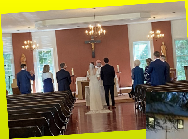
Joyful marriages at St. Agnes