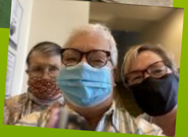
Successful Drive-Thru Multi-charity Food Drive