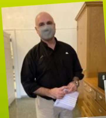
New 5 PM Sunday Mass in full swing at St. Catherine's