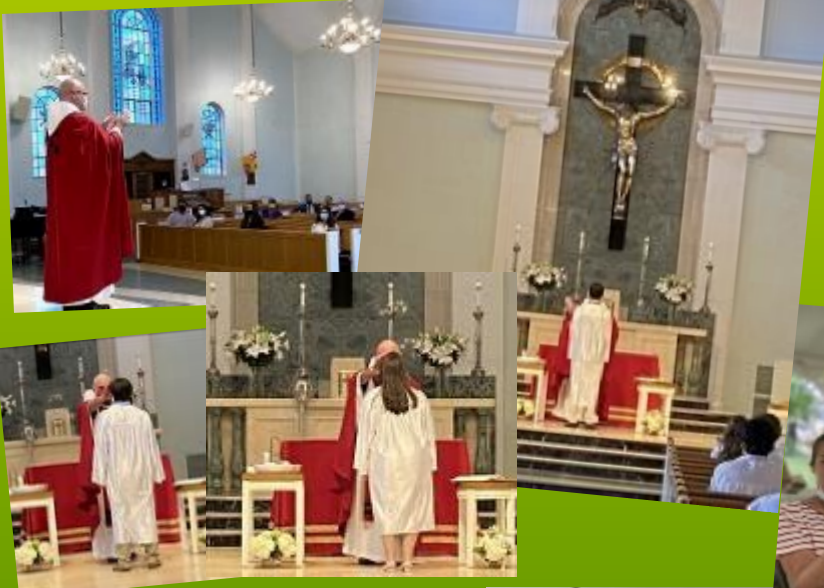
Confirmation at St. Catherine's