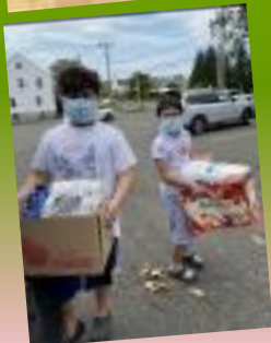
Food Drive for Neighbor to Neighbor Rocks on!